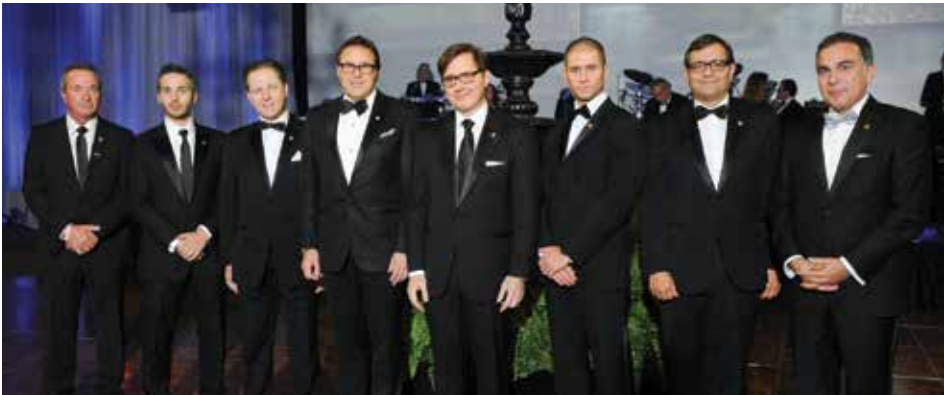
New Governors introduced at the 2013 Governors' Ball