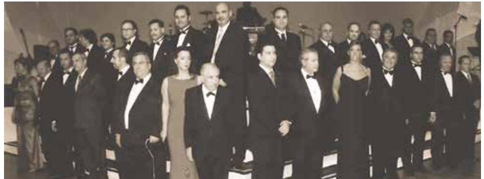
New Governors and Successors introduced at the 2004 Governors' Ball

Governors are invited to an annual Donor Recognition Cocktail held during the holiday period.